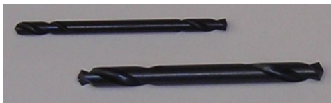
Double Ended Drill Bits