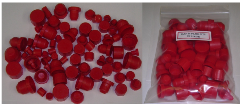
Caplug Kit - 72 Piece

This kit contains the following in a labeled, resealable clear plastic bag: