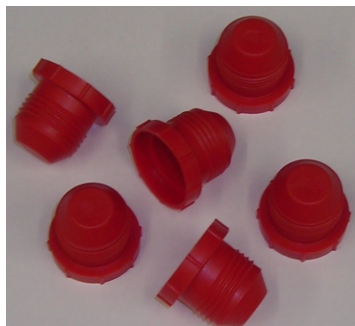
Caplugs for AN Series Fittings - Racer Packs