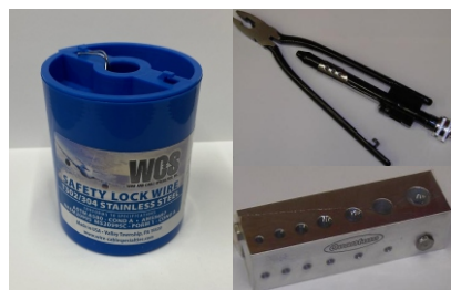
Safety Wire & Accessories