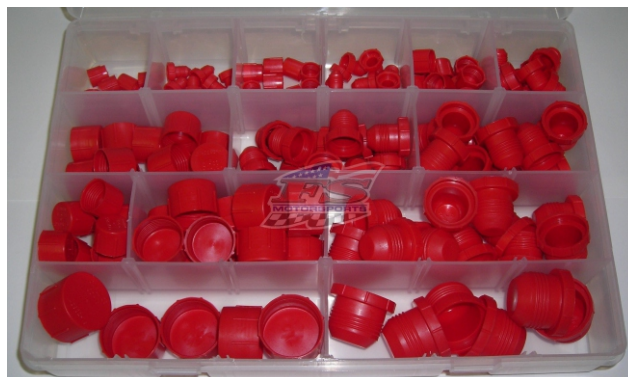
Caplug Kit - 156 Piece

This kit contains the following in a compartmented plastic case with a snap-shut lid. Each size has its own compartment.